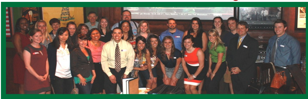
Public Health Sciences, Students and alumni at BlackFinn during National Public Health Week

The Graduate Public Health Association and the Charlotte Health Executive Student Organization, in cooperation with the Department of Public Health Sciences, hosted the second annual PHS graduate alumni networking event at BlackFinn American Saloon at The Epicentre during National Public Health Week. The abundance of students, faculty, and alumni, and great food made it a wonderful night for networking